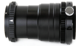
■ Flattner 61