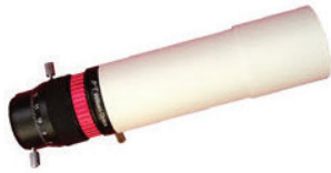
■ Finder Scope