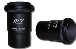
■ Canon Photo Adapter