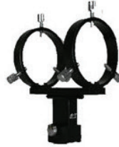
■ Finder Scope Mounting Bracket