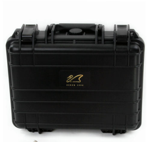
■ Airtight Hard Case

super Wild Angle(72°). 25mm,33mm,40mm focal lengths, FMC. Generous eye-relief.