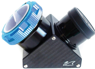
■ 2" Rotolock Durabright Dialectric Diagonal