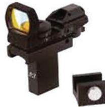
■ Red dot finder.