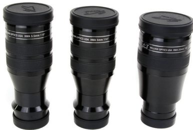
■ XWA (100°-110°) Eye Pieces